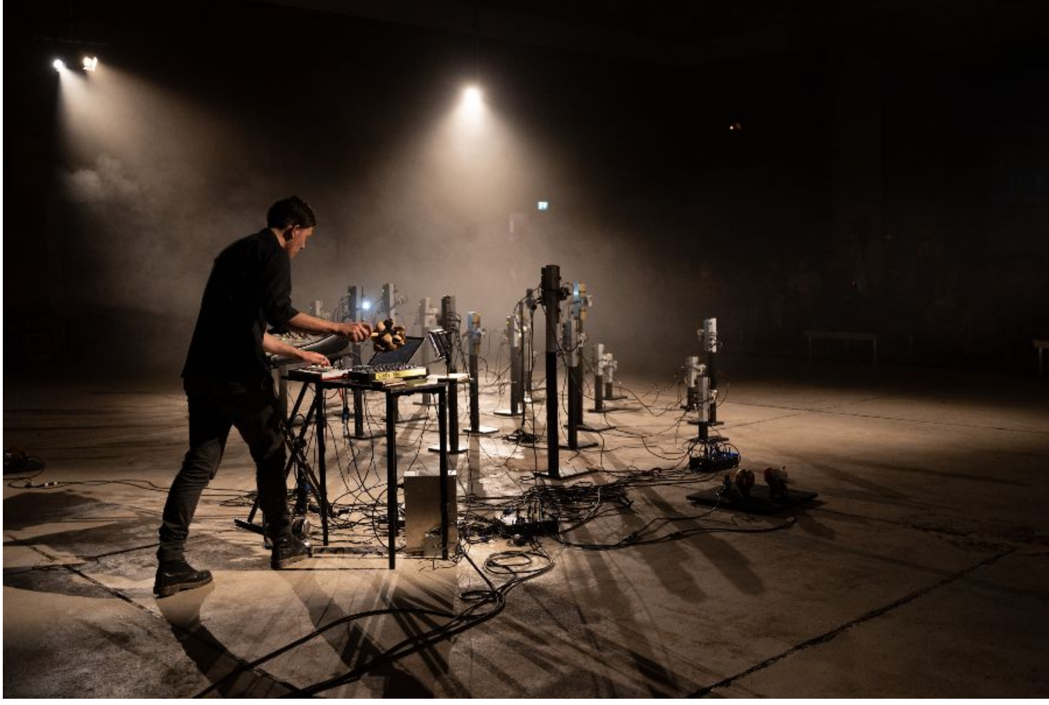
Moritz Simon Geist, VIBRATIONS Prototype , Werkleitz Festival 2021

2nd Festival Weekend move to ... ecosphere 25 June – 27 June